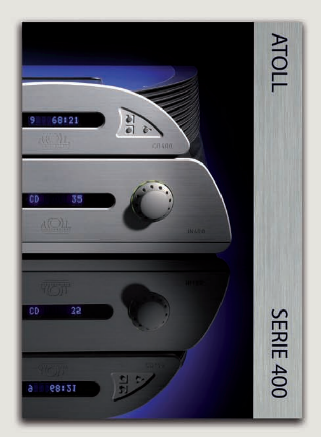
Brochure available for the 400 series including IN400 - PR400 - AM400 - CD-DR400se