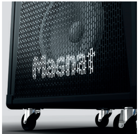
THE BULLDOG 7 IS THE GO-ANYWHERE SPEAKER

And that brings us to the 3-channel mixer with crossfader. A microphone or instrument can be connected to channel 1. Channel 2 can also be used for instruments or as line-in - even in stereo. And channel 3 offers the option of docking everything from smartphones to any other source via Bluetooth 5.0 or the Aux input directly on the mixer. The crossfader allows a quick change between channel 3 and the other inputs. For example, a microphone and music can be cross-faded intuitively.