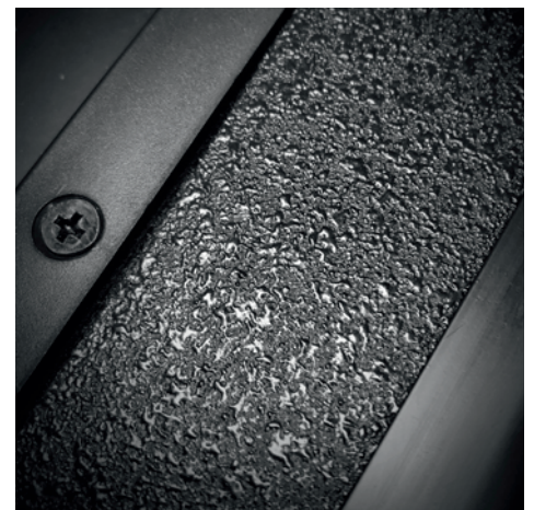
THE HOUSING? A STATEMENT

Admittedly, 35 kilos needs to be moved first. However, we have provided the Bulldog 7 with four sturdy transport casters. Two of them can be locked with a parking brake. This makes it easy to get the speaker out of the boot and move it to any conceivable location, where it will then not move from the spot any more. Support for sports teams? Check. Serious PA for the school party? Check. The right sound for your band? Naturally. Party on the beach? Okay, you have to lend a hand over the last few meters.