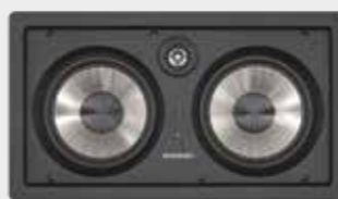
CASA CC60s BASE also with frame