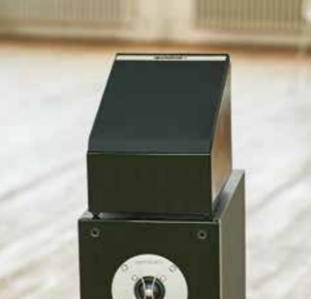
Add-on speaker PHASE A15 for a three dimensional sound experience