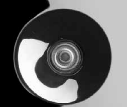
High value RiCom+ tweeter with complex wave guide.