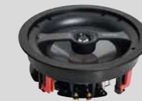
2-way coax arrangement CASA C8

All PHASE and CASA Series speakers are 2-way designs (except A15). This results in a very differentiated sound image with clear trebles and - for this size - a very voluminous foundation. The CASA built-in loudspeakers are equipped with an adjustable tweeter (+/- 2 dB) for individual adaptation to the room.