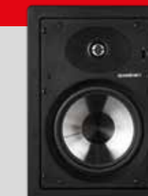
Classic 2-way arrangement CASA W60B