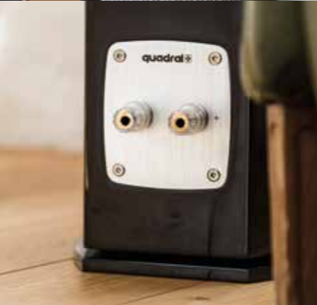
Metal-Terminal with gold-plated connections