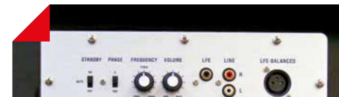
Ports- and Control panel QUBE 12