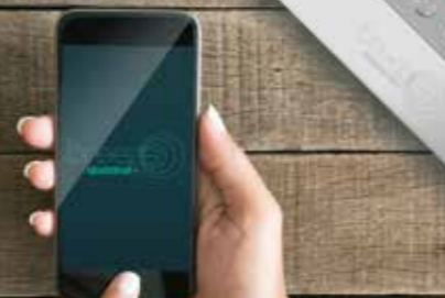
App remote and operating elements of metal

Your options are unlimited – whilst operation is a breeze!