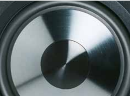
High-quality membrane For exceptional sound