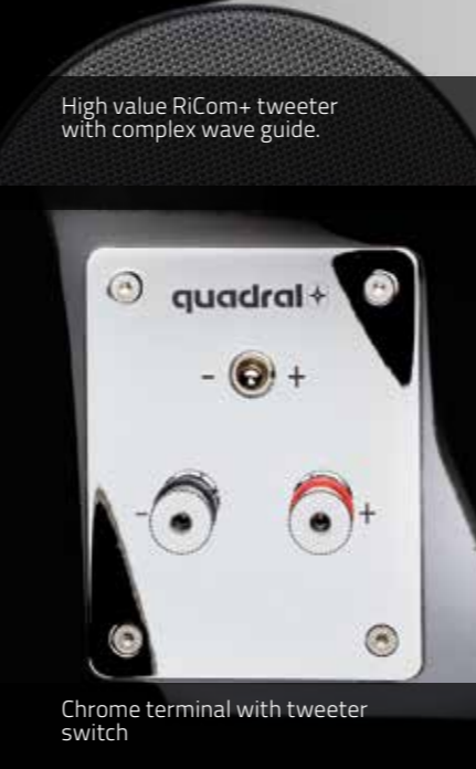
Chrome terminal with tweeter switch