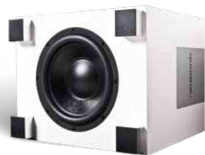
Woofer QUBE 12

Sound perfection. The low sound of a contrabass, the dark resonating beats of a kettle drum, the dull rumble of the storm, and often a resultant thunderous shake – it is often the subwoofer, which brings the experience to life. To render the low frequencies powerfully, membranes, cabinet, and electronics and their interplay were developed specifically for the job. A quadral subwoofer relieves the other speakers in the array, allowing them to then concentrate completely on the mid and high frequencies while the subwoofer drives that low end - with detailed precision, speed and depth.