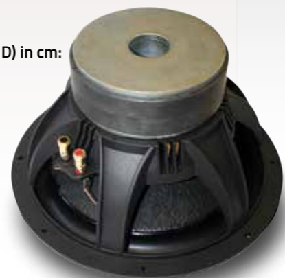
Chassis QUBE 12 with enormous magnet

Type: Principle: Nom./music power (W): Frequency response (Hz): Crossover frequencies (Hz): Input sensitivity (mV): Stand-by-control: Phase: Speaker woofer: Dimensions (H x W x D) in cm: Supply voltage (V): Weight (kg): Finish: