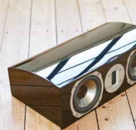
Curved cabinet lines with a noble high gloss varnish