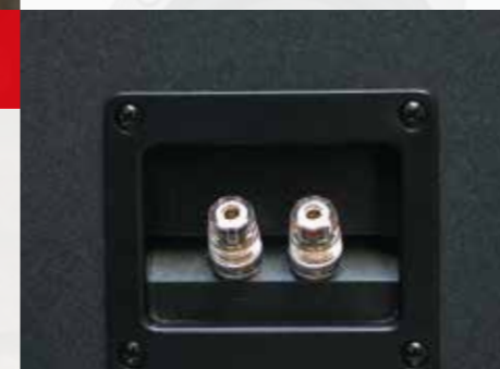
Gold - plated connections on all ARGENTUM loudspeakers