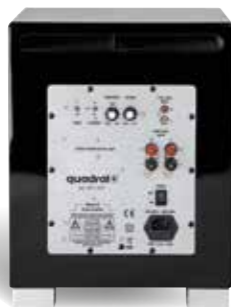
Rear QUBE 8