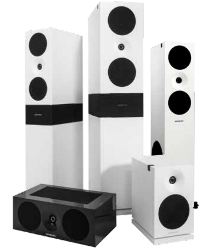
white semi gloss black high gloss finish

High wall thickness guarantees maximum impulse fidelity and lowest discoloration. And last but not least, the ring radiators with optimized waveguides provide a mature sound image.