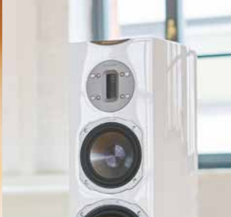
Ribbon tweeter & titanium coated polypropylene diaphragms