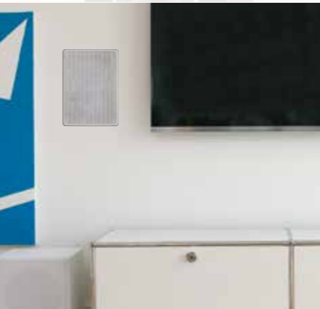
Almost invisible Discreet surround solution with CASA & QUBE