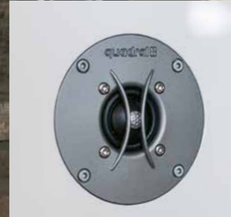
Super Audio Tweeter protected by a solid bracket