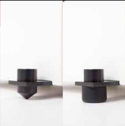
For all PLATINUM+ floor standing loudspeakers: High quality spike bars