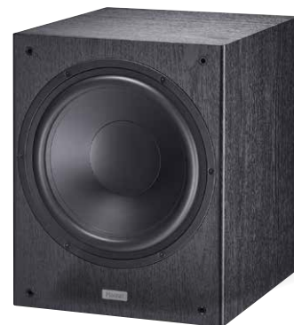
Tempus Sub 300A