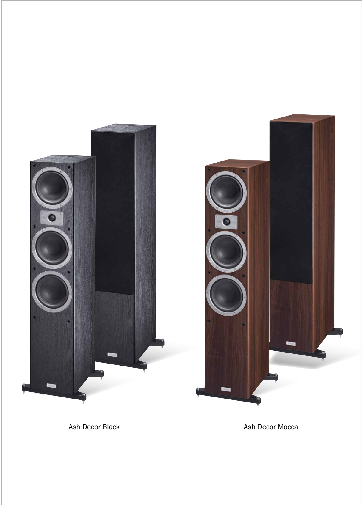
Ash Decor Black